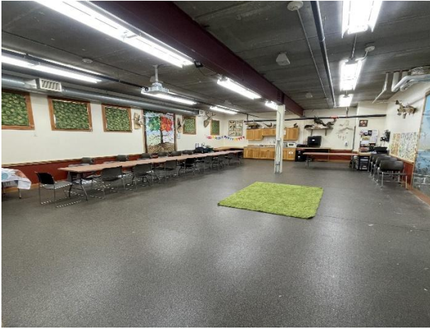
Lower Level Classroom A

There is limited cell phone reception in the party room, but guests are welcome to connect to our guest Wi-Fi.