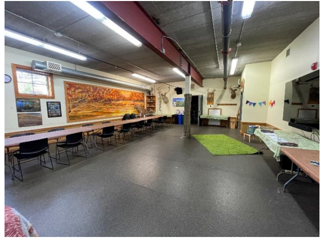
Lower Level Classroom B