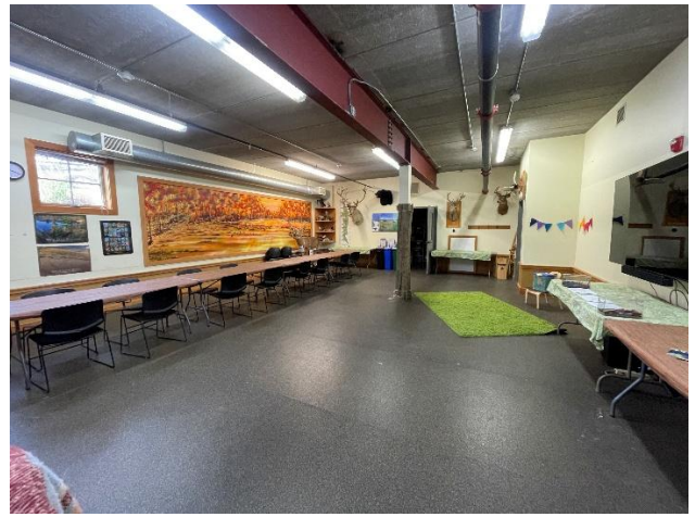
Lower Level Classroom B

Yes! The only decorations that we do not allow are piñatas, confetti, & glitter. If you have a bird of prey party, balloons should be kept to a minimum. Our staff will provide signage starting at the front door of our Great Hall, down to the party room to help guide guests. We greatly appreciate if your decorations or supplies are reusable, recyclable, or compostable to help achieve our sustainability initiatives. A felt “Happy Birthday” banner will be displayed in the party room as well.